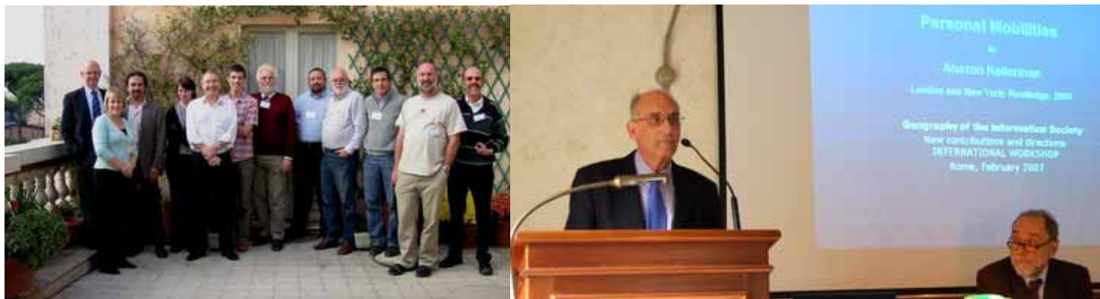
Left: participants in the SCAR meeting, relaxing on one of the terraces of the Home.