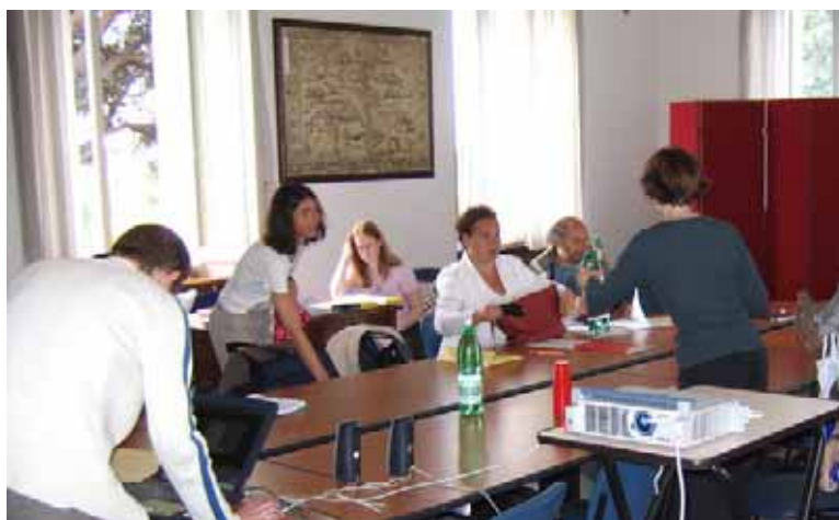
Members of the Imiscoe Cluster A1 in the “Sala Antinori” meeting room of the Società Geografica Italiana

The cluster A1 meeting in Rome focused on four areas of research: 1) post-enlargement migration (2004/2007); 2) the continuity of migration flows; 3) the future of migration control; and 4) transit migration. The meeting aimed to identify relevant questions within these broad areas that might guide the cluster work for the coming two years (the project will end in 2009). Based on the papers presented and the ensuing discussions, the participants agreed to work on the following issues: 1) What are the reasons for the emergence and the continuity of migration flows (geographical foci: Turkish migration to the EU and post-enlargement migration)? 2) What are the possible futures of migration control? 3) Is transit migration a useful concept for the social sciences and if so how can it be operationalised?