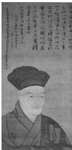
Fig.8: Sesshus self-portrait

Let us turn to Sesshū. We find in his paintings a tendency opposite to that of Dürer, that is, the superiority of the painting of the natural landscape – the so-called mountain-river painting – on that of the human figure. Let us look at a self-portrait painted when Sesshū was 71 years old (Figure 8). It has an inscription in which Sesshū identifies himself as the first monk in the Tendō temple in China under the Ming dynasty. We see that Sesshū thought of himself not as a mere “painter,” but as a “monk painter” who depicts his inner state of awakening. To what extent can this work be described as a masterpiece? It is undoubtedly great, but it is surely a question whether it is to be judged as superlative in comparison with Sesshū’s mountain-river paintings. Some of us will reserve judgment, asking themselves if the depicted figure adequately expresses what the inscribed poem states: “He sharply tells the truth that the flower as a phenomenon is empty (non-existent), having originally no form and not appearing.”