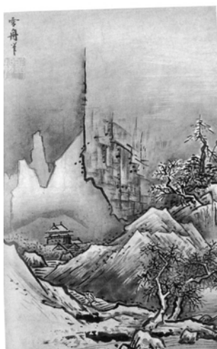
Fig.10: Winter painting

representative mountain-river paintings.