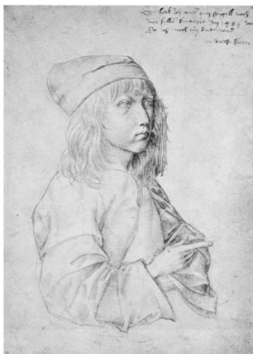
Fig.4: Duerers self-portrait