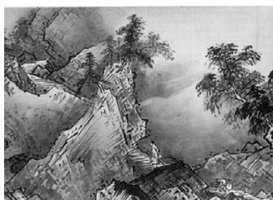
Fig.11: Long Scroll of Mountains and Rivers (1)

In Sesshū's mountain-river painting, the external world is painted as the expression of the inner nature of the human being. This is clearly seen in the so-called 16 meter long "Long Scroll of Mountains and Rivers (part)" (Figure 11). The mountain to which a Taoist monk climbs is the place of his practice, and the depicted scenes in the mountain are the stages of his mind in practice. The main subject is "nature" and not the mere human being. The persons who appear in the mountain-river painting are always very small, while the mountains are high and steep.