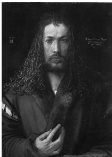
Fig.7: Duerers self-portrait

consciousness may be regarded as one of the characteristics of consciousness during the Renaissance. The self in which Godness is concealed must have divine grace, and just this is stressed in the self-portrait of 1498 (Figure 6). Dürer produced this work when he was 27 years old, though in the inscription on the canvas he depicts: “I painted it 1498. I was twenty six years old. Albrecht Dürer.” Monogram (Das malt Ich nach meiner gestalt/ Ich was sex vnd zwanzig jor alt/ |Albrecht Dürer/Monogramm).