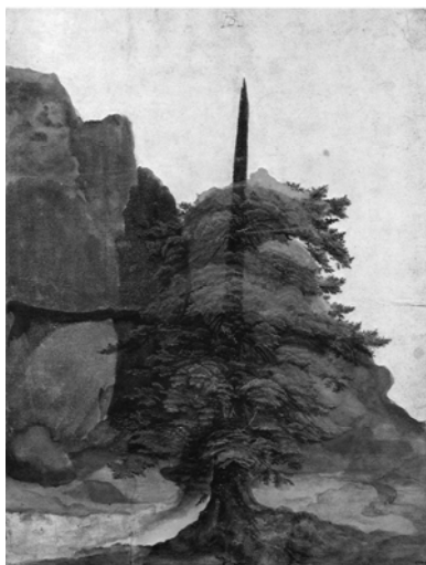
Fig.1: The tree at a stone quarry