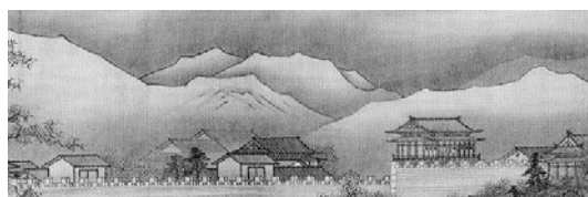
Fig.12: Long Scroll of Mountains and Rivers (2)

The whole body of Bodhidharma, except his face, is covered with a white piece of cloth, which has surely the same meaning as the “snow” in the last scene in “ Long Scroll of Mountains and Rivers (part) .”(Figure 12) Bodhidharma’s body is a phenomenon wrapped with the white