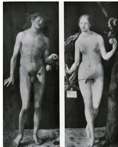
Fig.3: Adam and Eve

space, only representative works can be shown here. First, “ The tree at a stone quarry ” (Figure 1), which will be compared later with a work of Sesshū. In Dürer’s time, it was not self-evident that the landscape might become the subject of painting; hence, we see in this work the forefront of the sensitivity for the nature. But we must hesitate to evaluate the work as surpassing modern landscape painting, such as that of Cézanne. Let us turn our eyes to the portrait painting in “ Four Apostles ” (Figure 2) and “ Adam and Eve ” (Figure 3), where we find that the depicted figures express not only the iconographic characters at an excellent level artistically, but also their inner spirituality.