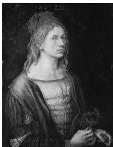
Fig.6: Duerers self-portrait