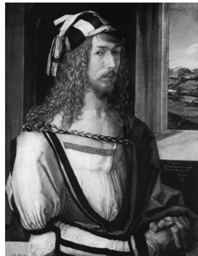
Fig.5: Duerers self-portrait

in the heavenly places” (ibid., 16: 12), shows that the person is Paul, as is maintained in other guidebooks.[3] Thus, the person in the background right must be Mark. His face, like that of Paul, is no longer directed into the testament, but outward. For, his mind is directed to the mission among the folk, as is suggested in Mark 16: 15: “And he (Jesus) said unto them, Go ye into all the world, and preach the gospel to the whole creation.” Both Mark and Paul dedicated themselves to the mission. The folds of Paul’s robes, which form more dynamic arc lines than that of John, look as if they spring and flow out of the closed Holy Bible held in Paul’s hand.