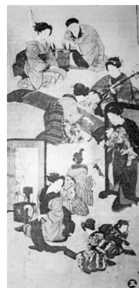
Figure 8: Kyoto Fujin Fūzoku Ikkadanran no zu , an image from the Yoshitaki Gashū