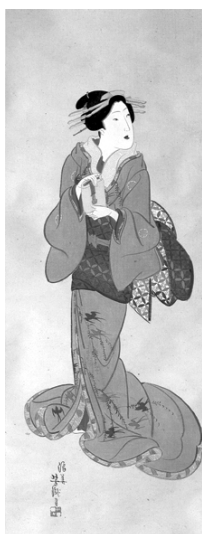
Figure 11: Shinzō Tachisugata zu , The British Museum, London

It is clear that “ Shinzō Tachisugata zu ” [Figure 11] (Standing Beauty) [18] was painted in a similar way to the “ Kabu Onkyoku zu ”. A woman standing alone holds what looks like a paper tissue case, slightly leaning on the right, and looking up in the air to the left side. She is in a blue-gray Kimono dress with designs of willows and swallows, tying a large red obi belts decorated with the Shippo (seven treasures) pattern. A red undergarment can be seen at the edge of the sleeves and hems, with a rounded drape contrasting with her slim lower body. Profile lines are thick and dynamic as seen in the soft curves from shoulders to sleeves. In this brush work, Yoshitaki gave volume to the dresses’ hems emphasizing thus the slenderness of the standing beauty. Her kimono dress has almost the same design as those seen in “ Kabu Onkyoku zu ”. Yoshitaki’s seal that reads “ Naniwa Yosyitaki ” (Yoshitaki of Osaka) is also the same.