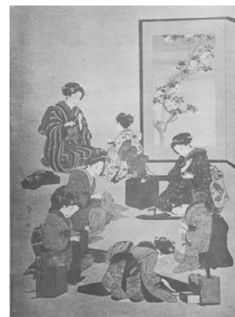
Figure 7: Fujin Fūzoku Saihō no zu , an image from the Photo Collections of Naikoku Kaiga Kyōshin Kai

This painting, too, was awarded the bronze prize at the second Naikoku Kaiga Kyōshinkai in 1884. At the bottom of the picture, a woman is sewing while watching over her child's studying, and another woman is giving something to a woman holding a toddler. Behind screens the two partitioning screens in the middle of the picture, two women are playing each a different instrument, Koto (Japanese harp) and Shamisen (a three strings music instrument). At the top of the picture, we can see a sixth woman and an elderly man next to a charcoal brazier, both listening to music. Overall, this vertically shaped picture evokes a happy gathering in a family room. The composition can be divided into three parts whereby the figures in each group sit or stand face to face. While the room