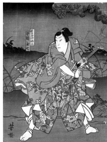
Figure 1: Keisei Ōmonguchi , Kamigata Ukiyo-e Museum, Osaka

Yoshitaki's work first appeared around 1854 [10]. Ansei was a time for Yoshitaki to establish his own style. In “ Keisei Ōmonguchi ” (1859) [Figure 1], the physical shape of the actor is somehow distorted, especially the balance between the head and the body. Similarly, the lines from neck to shoulder are not clear, making the way the arms relate to the body look unnatural. As a result, the upper body is oddly flat and does not look real. This kind of improper balance is often observed in his early works, but he quickly acquired skills in drawing body shape and catching the movement of actors with simple and moderately curved lines, so that figures appeared more natural.