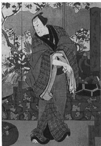
Figure 5: Akegarasu Tsuyuno Nuregoromo , an image from the Japanese Art Catalogue in the Náprstkovo Muzeum Collection, the Czech Republic