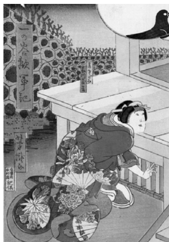
Figure 3: Ichinotani Futabagunki , Kamigata Ukiyo-e Museum, Osaka