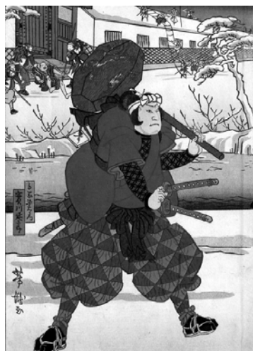
Figure 2: Kanadehon Chūsin Gura , Kamigata Ukiyo-e Museum, Osaka

During this time, Yoshitaki rendered the shapes of arms and legs with accuracy as well as the volume of the body. By doing so, he managed to express the strong presence of actors as if their auras on stage also appeared in prints. This can be seen in “ Kanadehon Chūsin Gura ” [Figure 2]. The actor is depicted in a balanced way with a well-built upper body, a firm stance with spread legs, which contrasts with the flat figure in “ Keisei Ōmonguchi ”. Yoshitaki's new style can also be seen in the shape of shoulders and the round hems of costumes. This change was clear in other works too, such as “ Ichinotani Futabagunki ” [Figure 3] in which the costume of an actor playing a female role was drawn in delicately curved lines, clearly expressing the thickness and soft texture of the fabric. In the same way, Yoshitaki used soft curves for the wrinkles on the sleeves of the actor also playing a female role in “ Asamagadake Omokage Zōshi ” [Figure 4] (1871). During this time, actors in his picture were still depicted with a round shaped body.