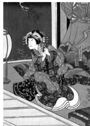
Figure 4: Asamagadake Omokage Zōshi , Kamigata Ukiyo-e Museum, Osaka