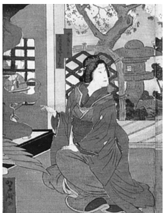
Figure 6: Yumeji no Tabi Seiyō Meguri , an image from the Japanese Art Catalogue in the Náprstkovo Muzeum Collection, the Czech Republic