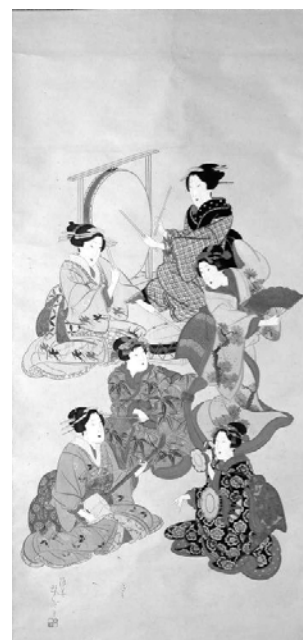
Figure 10: Kabu Onkyoku zu , MFA, Boston

This style, expressing the glamorous air of the scene by the colorful and fine designs of the Kimono dresses and the obi belts, is typical of Yoshitaki’s hand paintings in the Meiji era, as already mentioned. On the other hand, in this picture Yoshitaki used sophisticated curved lines to make the shoulders and elbows look round. Additionally, he outlined figures with