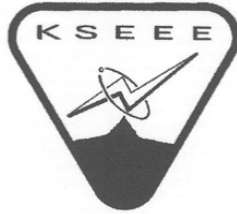
Kenya Society of Electrical & Electronic Engineers (KSEEE)